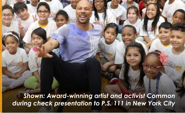
Shown: Award-winning artist and activist Common during check presentation to P.S. 111 in New York City